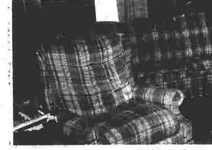
LIVING ROOM HAS A BRICK FIREPLACE WITH SLATE HEARTH ... kitchen and dining room are combined.

A STAIRWAY SEPARATES kitchen from living room. Upstairs, to the left, is a large bedroom, and the bedroom is something which