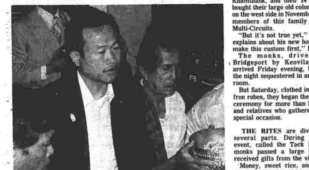
Buddhist monks receive gifts from visitors at start of rites...

It was just an ordinary Saturday in May. A good day to work in the garden, trim bushes, or cut grass.