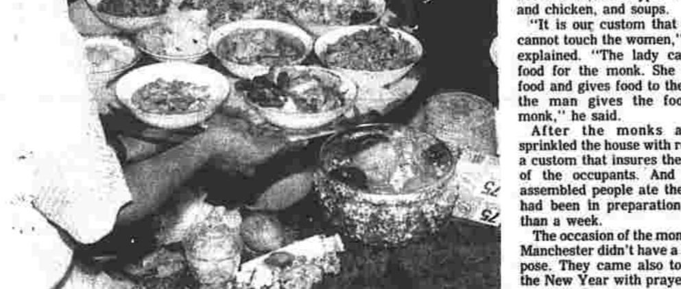
Laotian foods are passed to visitors... more than 50 people attended