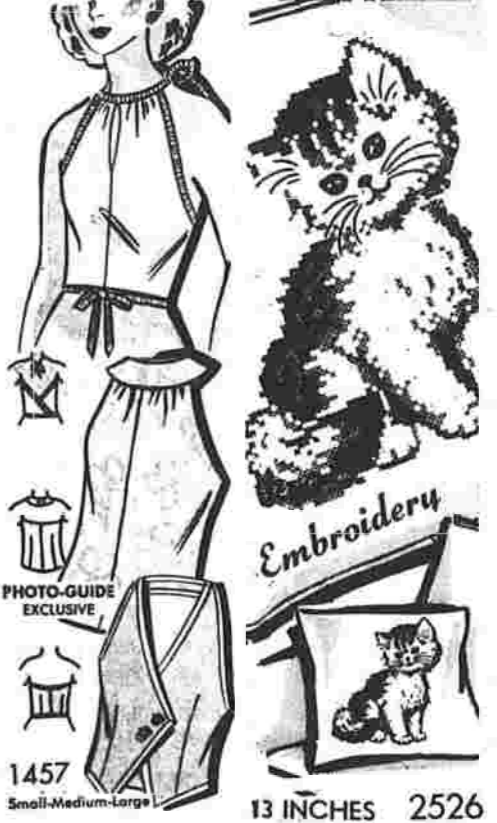
PHOTO-GUIDE EXCLUSIVE. Cross-stitch kitten motifs for pillow tops or mats. Easy and fun to do. No. 2526 has transfer for 3 motifs; color chart. No. 1457 with Photo-Guide in Sizes Small, Medium and Large. Medium (best 34-36), wrap-style, 4 1/2 yds. 100% cotton, yoked top, 1 1/2 yards; vest, 7/8 yard.