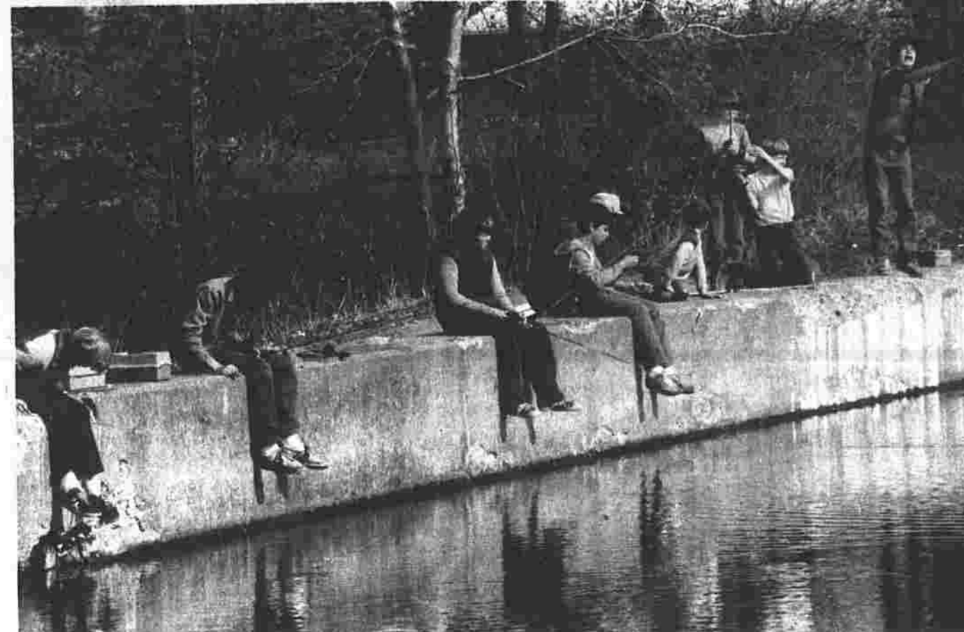
FISHING DERBY ATTRACTS YOUNGSTERS AT SALTER'S POND ... Saturday competition staged by Manchester State Bank