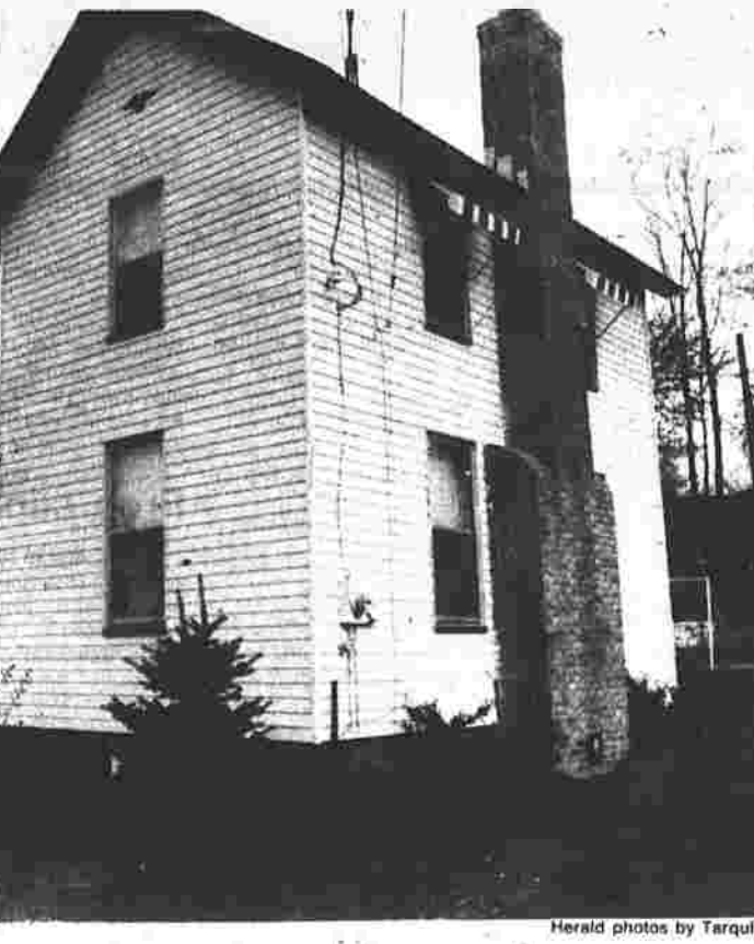
EXTERIOR OF HOUSE AT 486 MAIN ST. ... home has aluminum siding.

Outside is a wood-frame two-car garage, and partially fenced back yard area. Machie says the lot measures approximately 45 feet by 90 feet. There is a basement. The house is heated with gas—a fairly new furnace, the owner says. It is aluminum sided, except for the porch enclosure. Another feature: it is located on the busline.