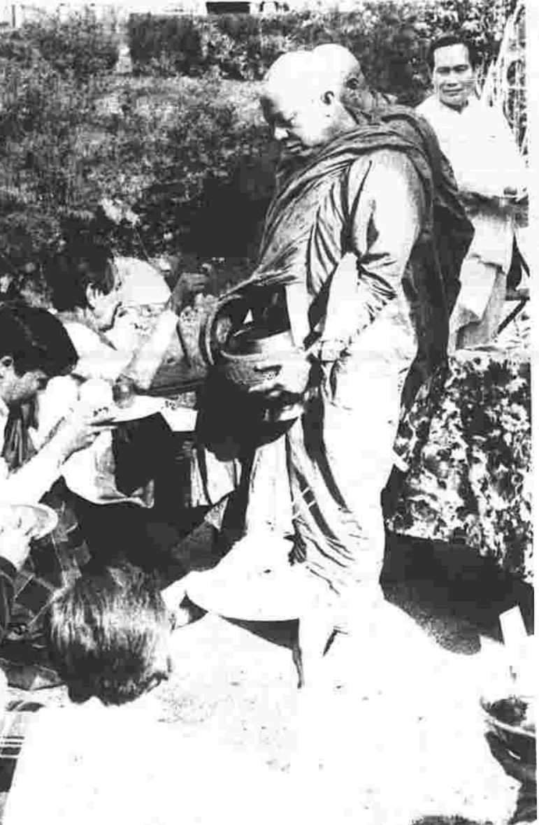
Buddhist monks receive gifts from visitors at start of rites...